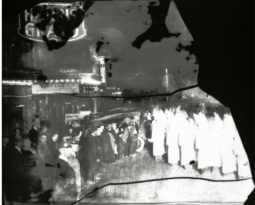
Mathers Museum Shaw-Starks Collection (73-11-0002)

Lesson 5 or other experience in describing and interpreting photographs. You may wish to have students work in small groups of three to five for this lesson.